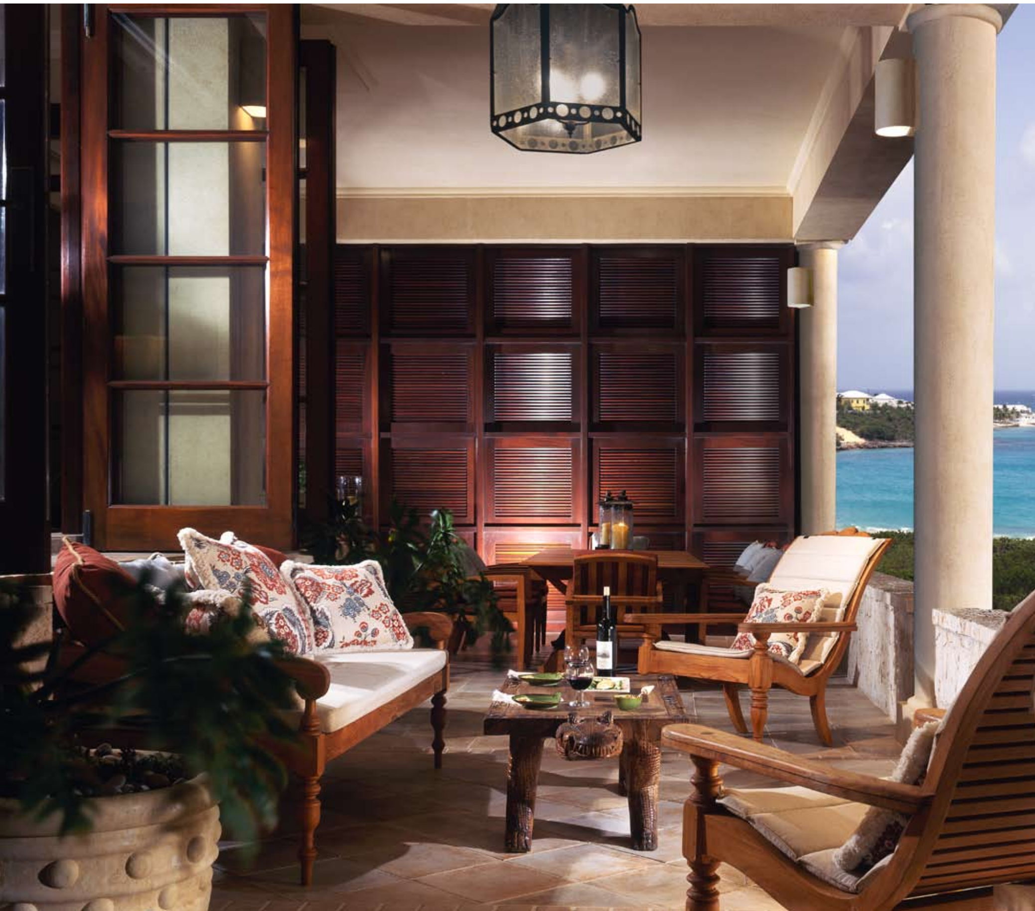
Above: An outdoor living and dining space allows the Dills to entertain on temperate Anguilla nights