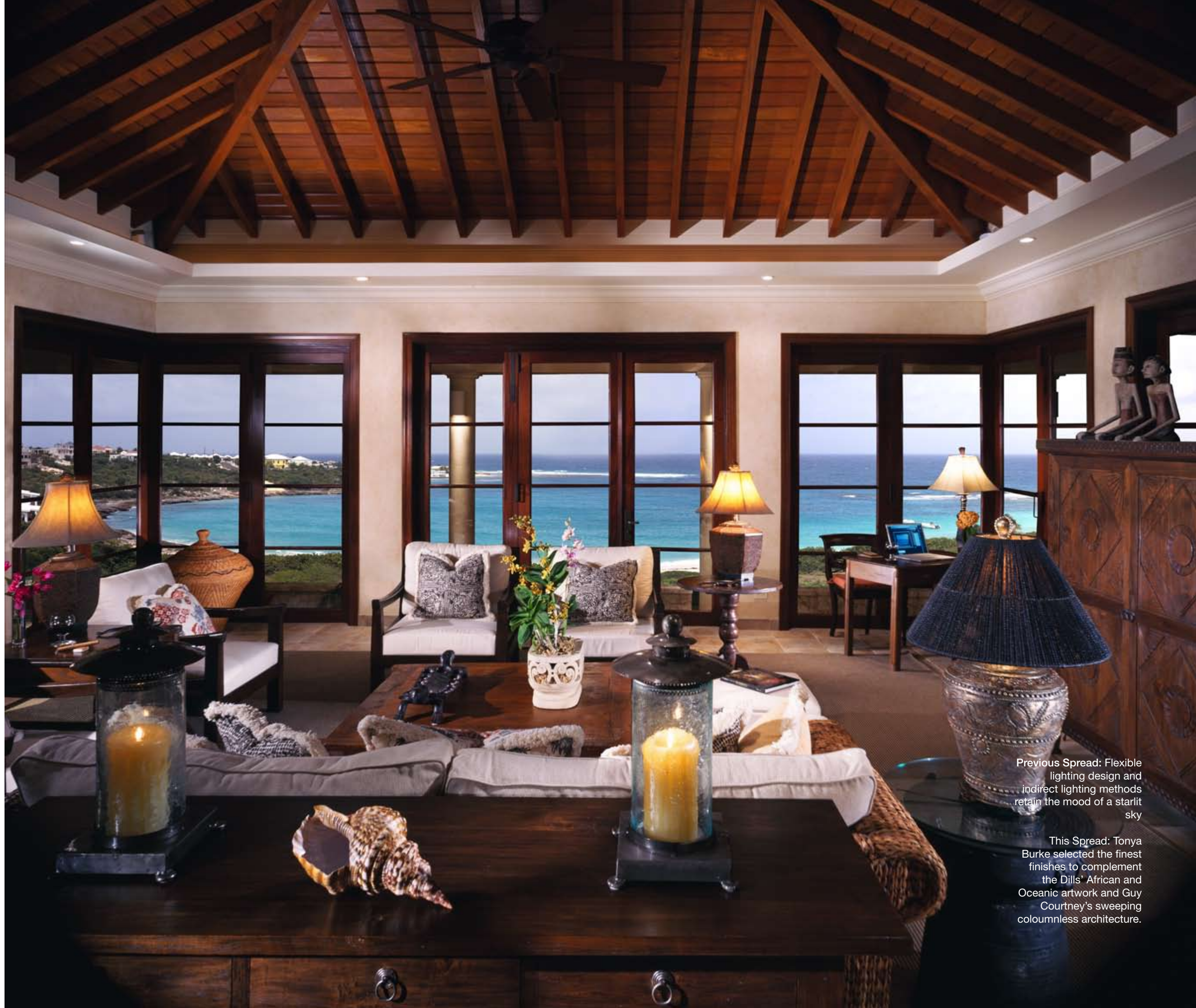
Previous Spread: Flexible lighting design and indirect lighting methods retain the mood of a starlit sky

“The design approach was inspired by Southeast Asian resorts, particularly Bali. The design of the space between the indoor and outdoor was of ▶